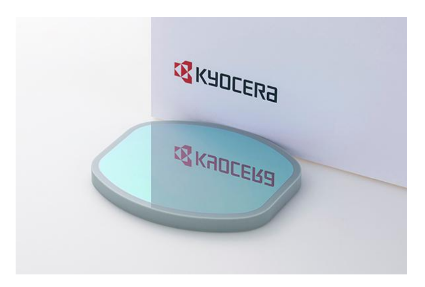
Ceramic mirror made of Fine Cordierite