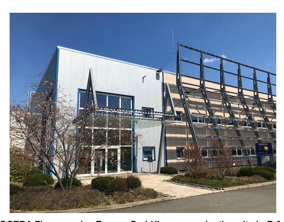
KYOCERA Fineceramics Europe GmbH's new production site in Erfurt