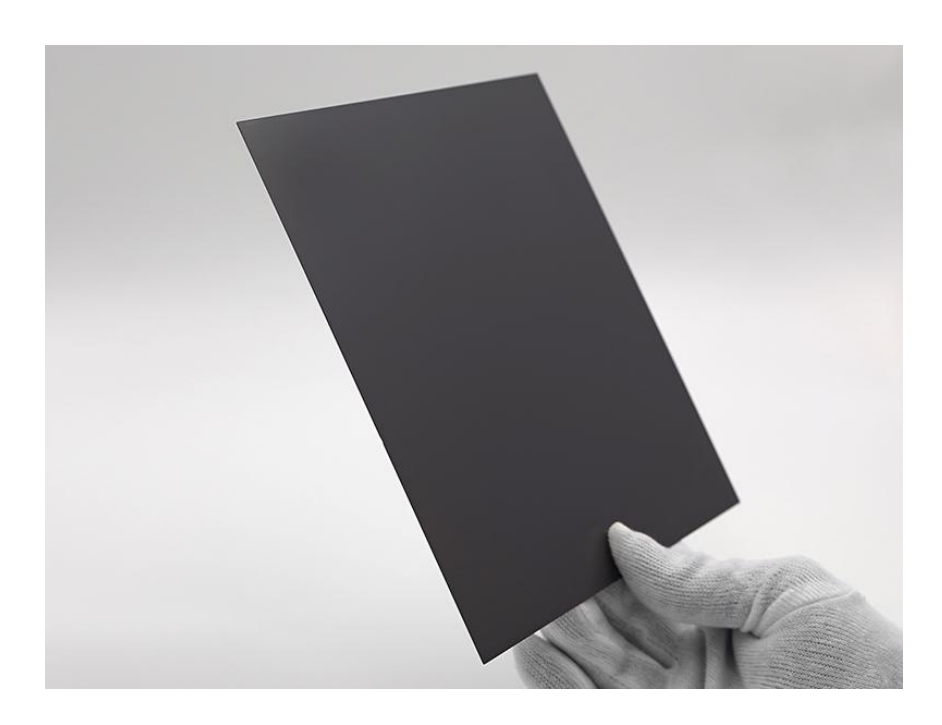
High-precision silicon nitride discs